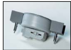
Monopoint with bracket